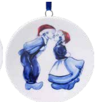
#297048 Kissing Couple $12.95