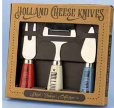
#310401 Cheese Knife Set $22.95