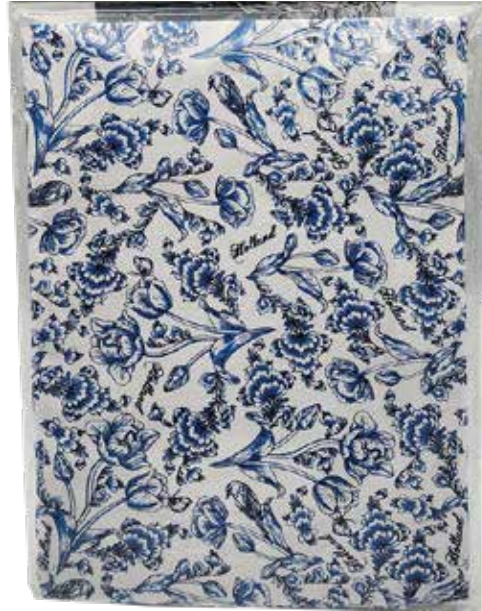
#060807 Tea Towel $13.95