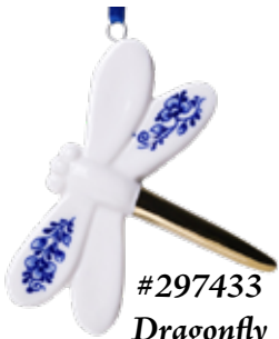
#297433 Dragonfly $14.95