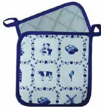
#060311 Potholder $9.95