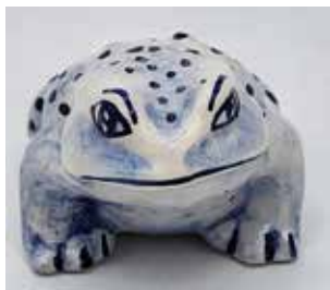
#010924.12 Sm Frog $52.95

Also available in Blue Tulip (011013.13)