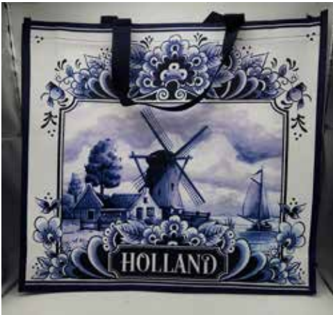
#310388 Shopping Bag $8.95