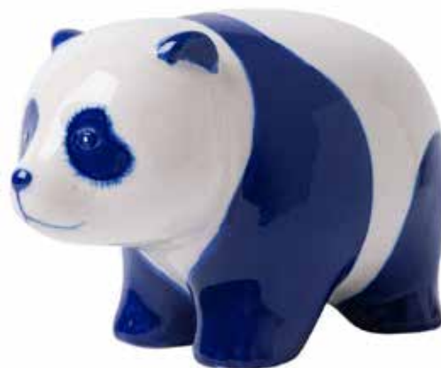
#297850 Panda 3"H x 5"L $29.95