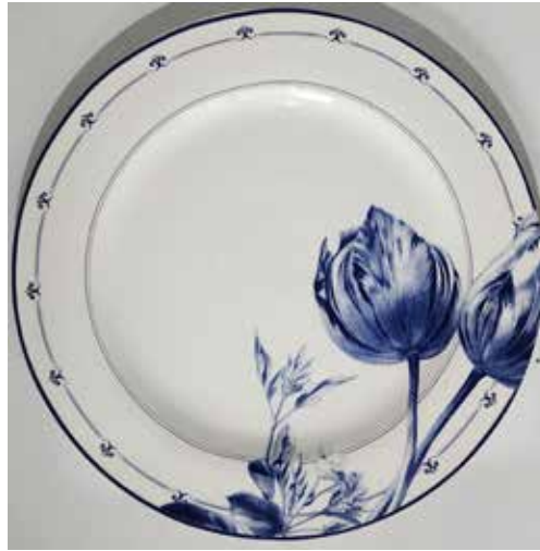
#295601 10" Plate $34.95