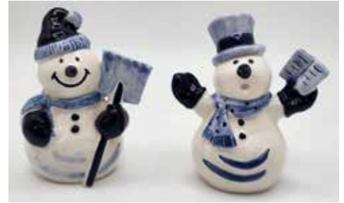
#010591.12 Asst Sm Comic Snowmen $39.95 ea