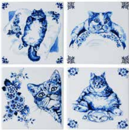
#291743 Coasters, Set of 4 $19.95