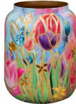
#039747 Small Vase $99.99