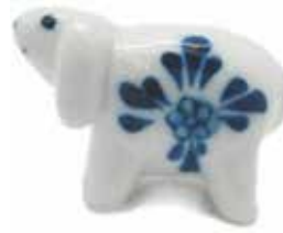
#610151 Mini Lamb $4.95