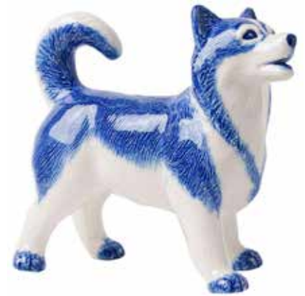
#297806 Husky 4.5"H x 5"L $29.95