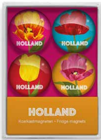
#105244 Magnet Set $12.95