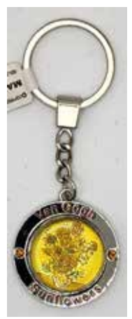
#310683 Keychain $5.95