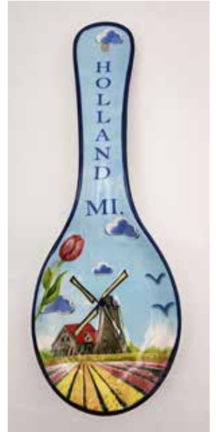
#610510 Spoon Rest $12.95