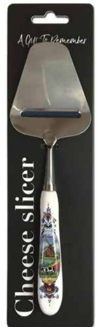
#060042 Cheese Slicer $11.95