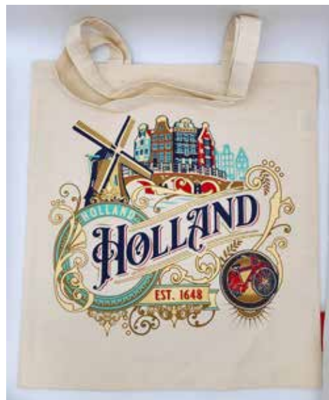
#310308 Cloth Shopping Bag $9.95