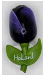
#128262 Magnet $4.95