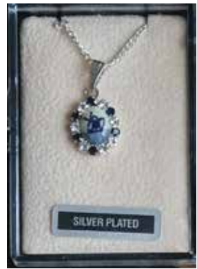
162375 - $20.95