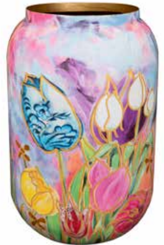
#039748 Large Vase $279.99