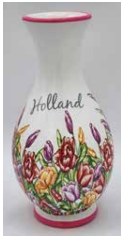
#060252 Vase - 5"H $10.95