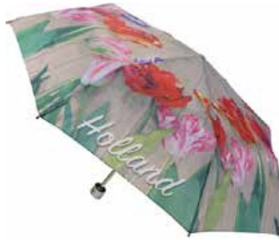
#060022 Umbrella $13.95