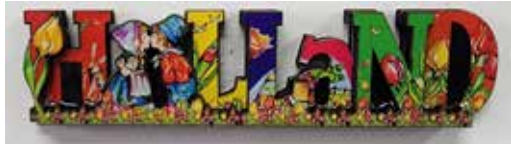
#039925 Magnet $5.95