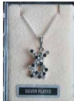
162382 - $20.95