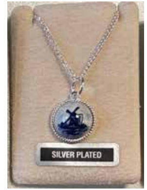
162100 - $18.95