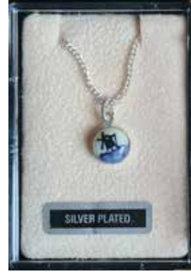
162352 - $14.95