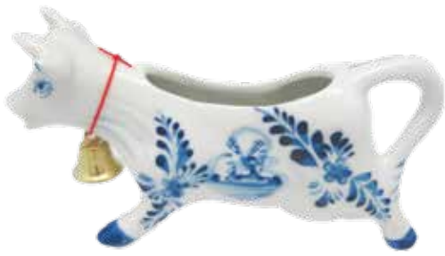
#610311 Cow Creamer $10.95