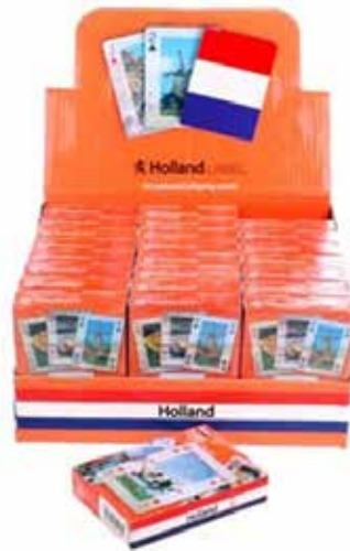
#060199 Playing Cards $5.95 ea