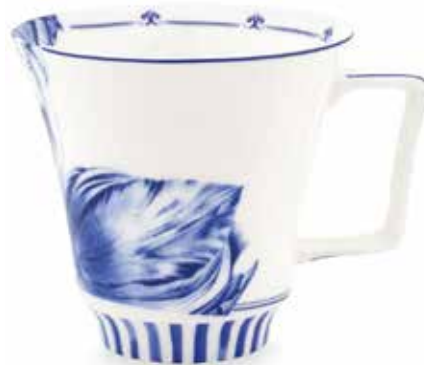
#295201 ≈12oz Mug - 4"H $23.95