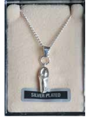
162361 - $14.95