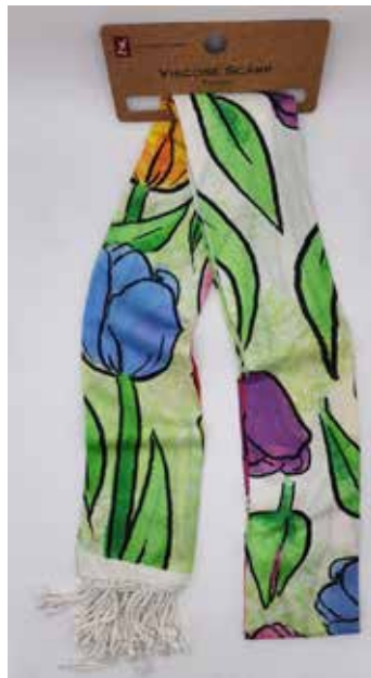
#882662 Scarf $19.95