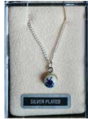
162396 - $14.95