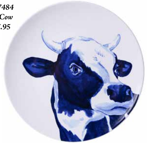
#297484 12" Cow $87.95