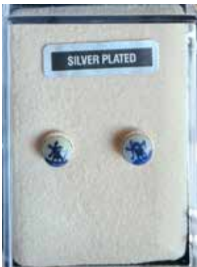
162324 - $14.95