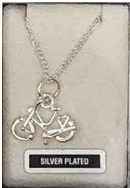
#160391 Necklace $15.95