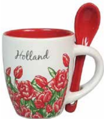
#060106 Espresso Mug w/ Spoon $9.95