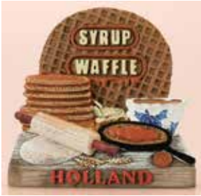
#310811 Magnet $4.95