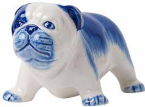
#297807 Bulldog 2.75"H x 4.75"L $29.95