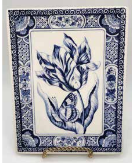
#010175.13 Applique - 7.75"H x 6"W $56.95