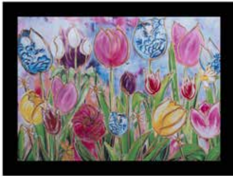
#039753 Framed Painting - 12"x8" $44.95