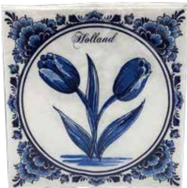
#060951 Napkins $6.95