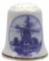
#610464 Thimble $5.95