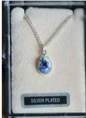
162336 - $14.95