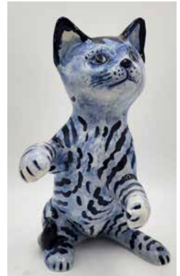
#010950.12 Asst Big Striped Cats $116.95 ea