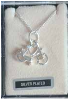
162391 - $15.95