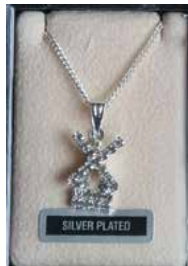
162381 - $20.95