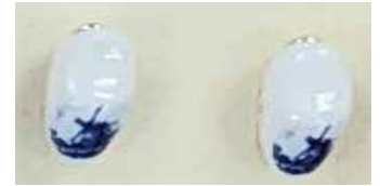
#160331 Earrings $14.95