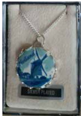
162397 - $17.95