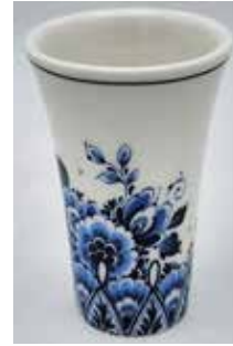
#291597 Shot Glass $7.95