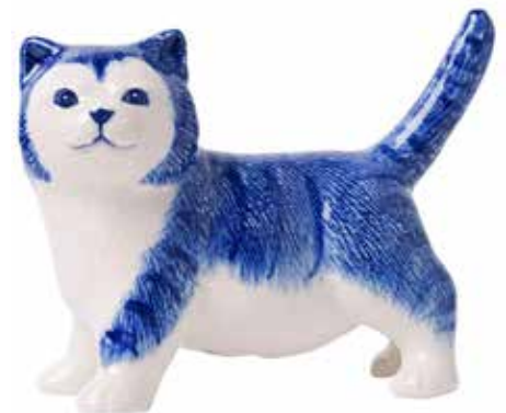
#294800 Standing Cat 4"L x 3"H $29.95