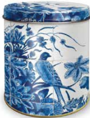
#104492 Storage Tin $10.95