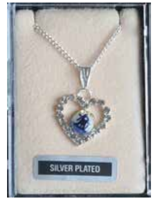
162378 - $20.95