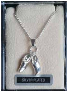
162013 - $21.95