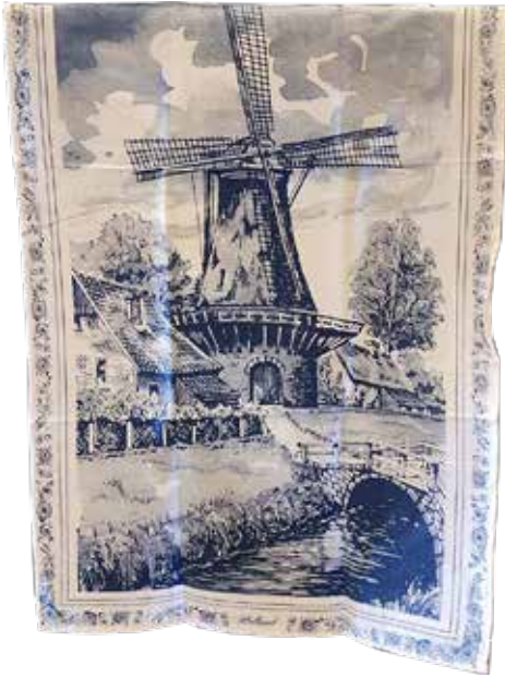
#060605 Tea Towel $11.95