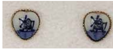
#160324 Earrings $14.95