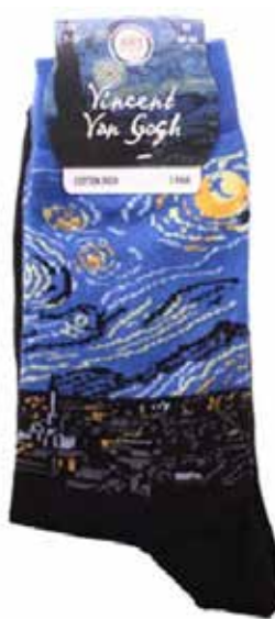
#264204 Socks $6.95