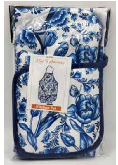
#060602 Apron/Potholder/Oven Mitt $19.95