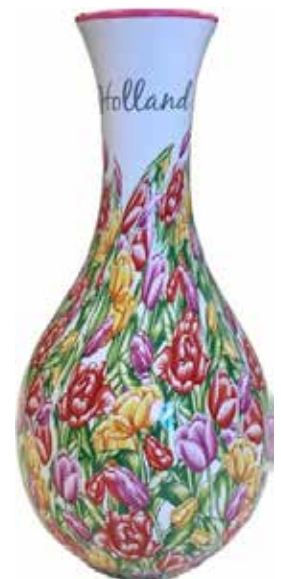
#060621 Vase - 12"H $38.95