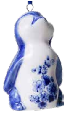
#297435 Penguin $14.95