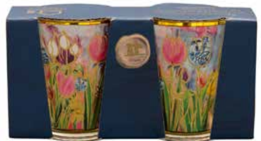
#039758 Set of 2 Shot Glasses $15.95