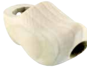
#071280 Bolo Tie, Plain $3.95