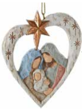
#260286 Nativity Scene $9.99