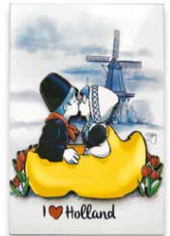
#105401 Magnet $4.95