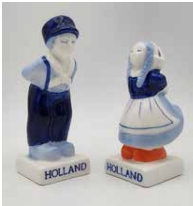
#294409 Salt & Pepper Set $16.95