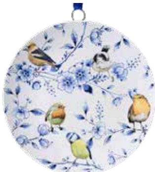
#297452 Forest Bird, Blossom $12.95