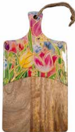
#039762 Cheeseboard $24.95