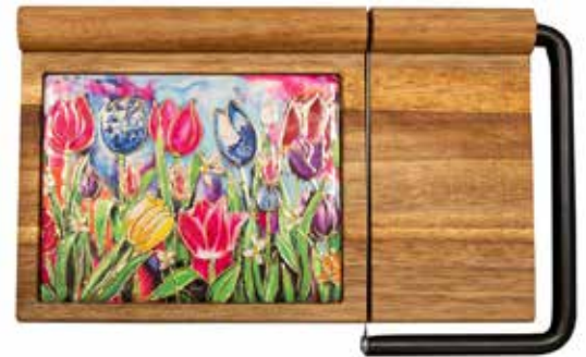
#039771 Cheeseboard w/ Built-in Cutter $34.95