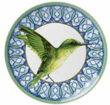
#297467 8" Hummingbird $49.95