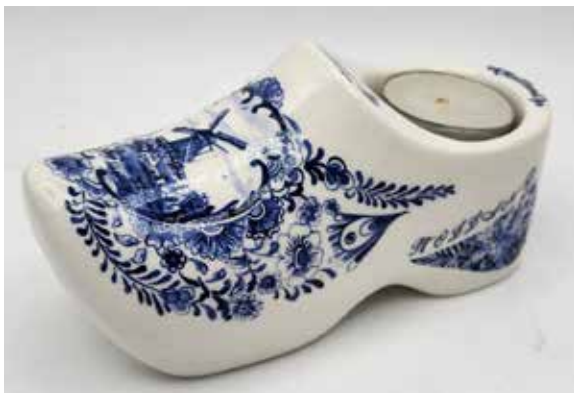
#310034 Ceramic Shoe w/ Candle $12.95