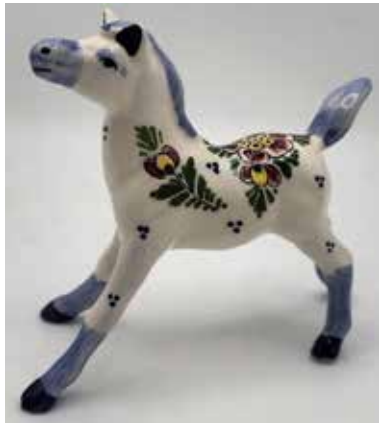
#010699.22 Sm Horse Poly $112.95