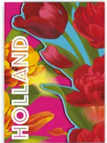
#105370 Notebook $14.95