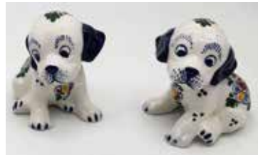
#010793.22 Multicolor $69.95 ea