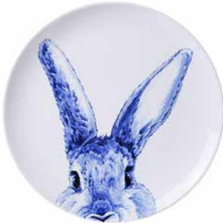
#297485 10.5" Hare $67.95