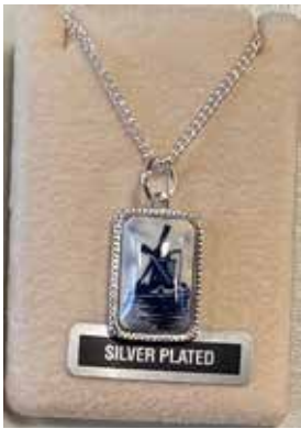
162102 - $18.95