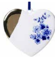
#297426 Heart w/ Gold $14.95