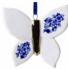
#297432 Butterfly w/ Gold $14.95