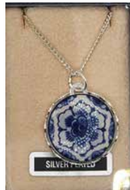
162398 - $17.95