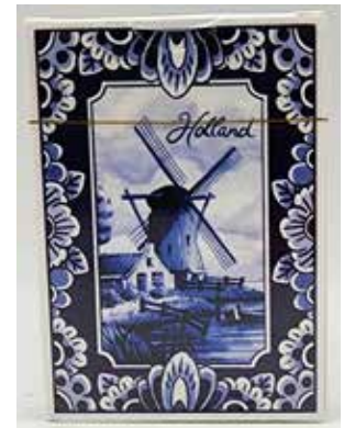
#310106 Playing Cards $5.95