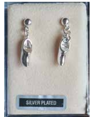
162364 - $15.95