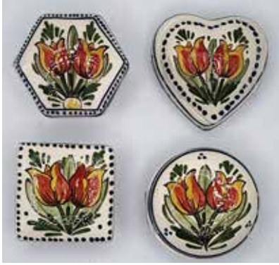
#010165.23 Asst Mini Covered Boxes $61.95 ea