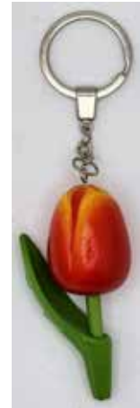
#310271 Keychain $4.95