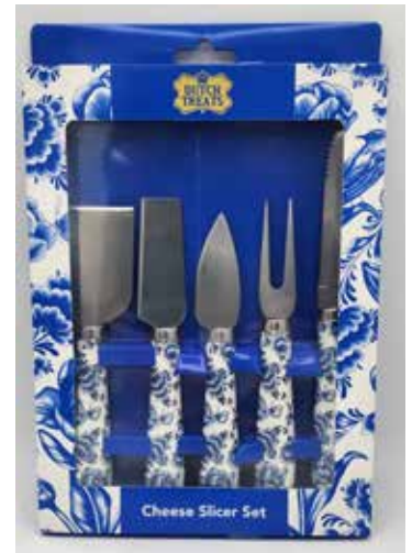
#060639 Set of 5 Cheese Slicers $19.95