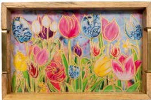
#038761 Serving Tray $89.99