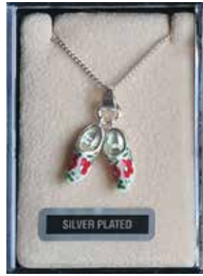
162014 - $22.95