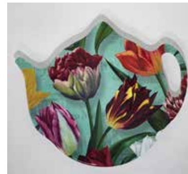
#310711 Teabag Holder $5.95