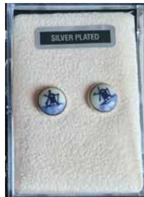
162358 - $14.95