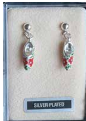
162390 - $17.95