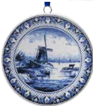
#297457 Windmill $12.95