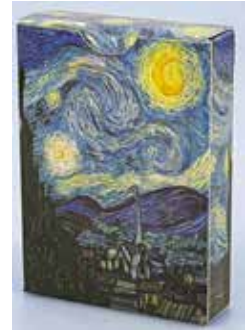
#310110 Playing Cards $5.95