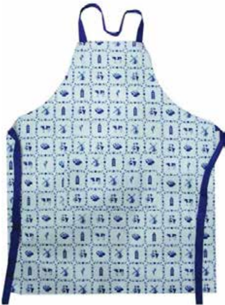
#260003 Apron $19.95