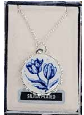
#160398 Necklace $17.95