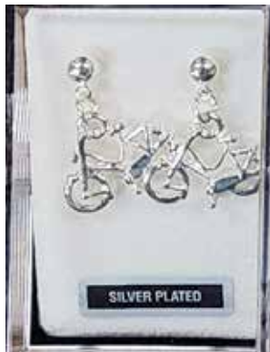
#160394 Earrings $16.95