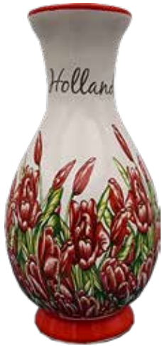
#060251 Vase - 5"H $10.95