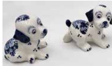
#010793.12 Blue/White $66.95 ea