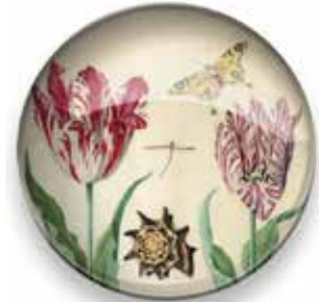
#105149 Glass Magnet $6.95