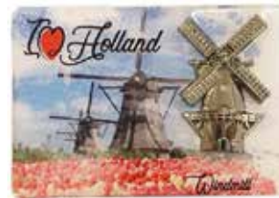
#060516 Magnet $4.95