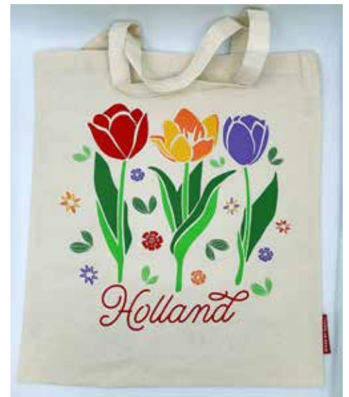
#310372 Cloth Shopping Bag $9.95