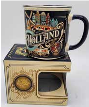
#310696 Sm Boxed Mug $11.95