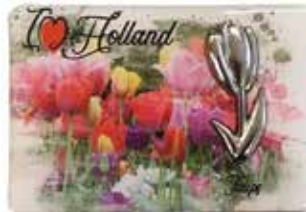
#060119 Magnet $4.95