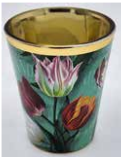
#310965 Shot Glasses - $7.95 ea