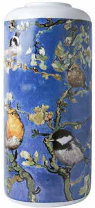
#294403 12" Cylinder Vase $96.95