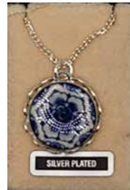
#160397 Necklace $17.95