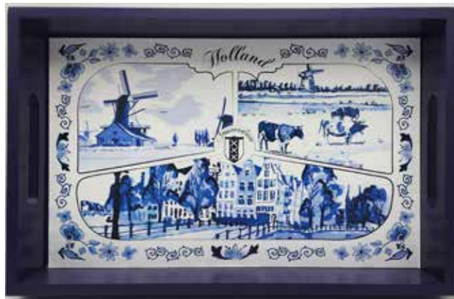
#060840 Serving Tray $24.95