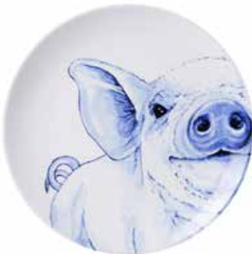
#297488 8" Pig $57.95