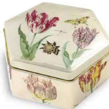
#105704 Storage Tin $11.95