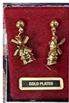
#160373 Earrings $17.95