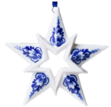
#297442 Dual Star $14.95