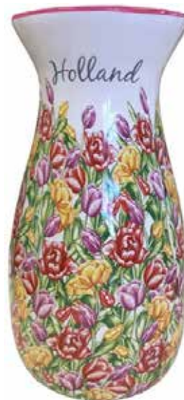
#060620 Vase - 12"H $38.95