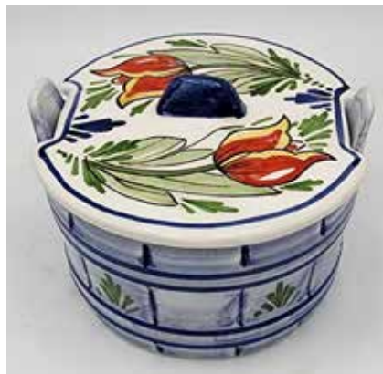
#011013.23 Covered Butter Dish $71.95

Also available in Blue Tulip (011013.13)