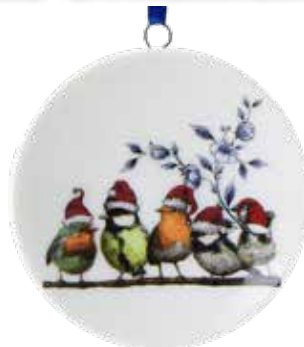
#297779 Forest Bird, Santa $12.95