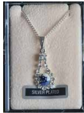
162377 - $20.95