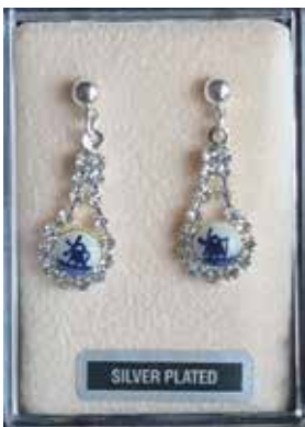
162366 - $22.95