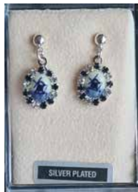
162385 - $22.95