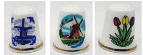
#160115 #160116 #160125