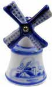
#610131 Bell 2.5"H $7.95