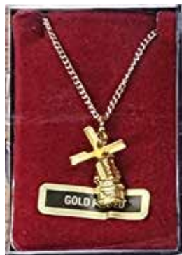
#160371 Necklace $16.95