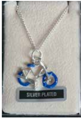
162393 - $16.95