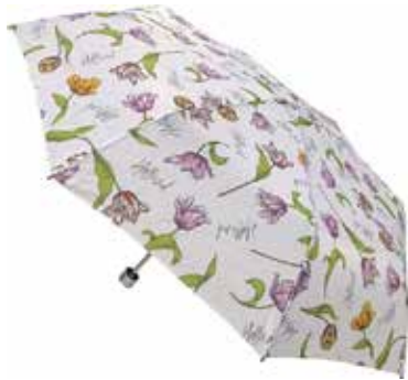
#060021 Umbrella $13.95