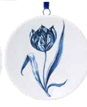
#297449 Tulip $12.95