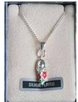
162387 - $17.95