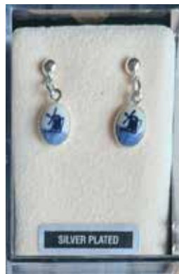
162339 - $14.95