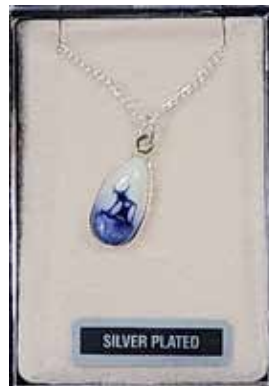
#160395 Necklace $16.95