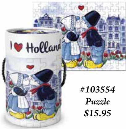
#103554 Puzzle $15.95