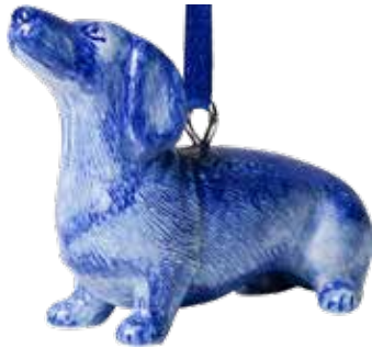
#297056 Sitting Dachshund $28.95