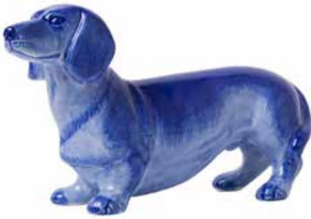
#297802 Dachshund 6"L $29.95