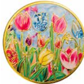
#039756 8" Round Trivet $18.95