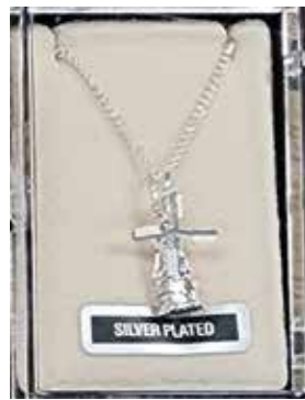
#160372 Necklace $16.95