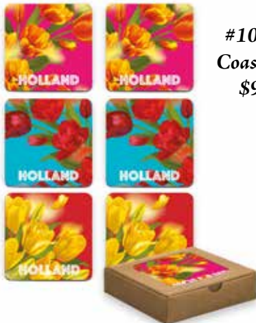
#105853 Coaster Set $9.95