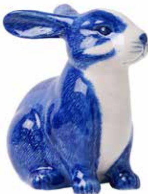
#297809 Sitting Rabbit 3.5"H x 3"L $29.95