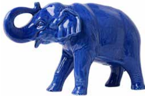
#297803 Elephant 4.75"H x 7"L $29.95