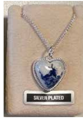
162063 - $18.95