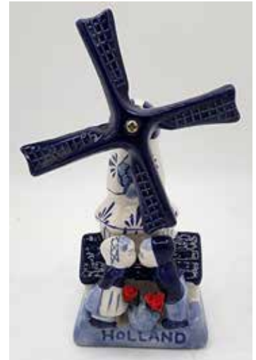
#039518 Windmill - 6.25"H $16.95