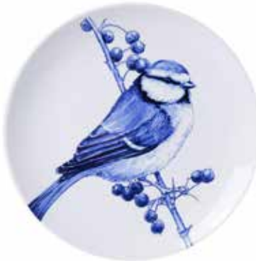
#297490 8" Titmouse $57.95