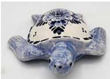
#010802.12 Sm Seaturtle $63.95