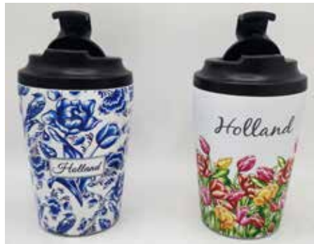
#060197 #060195 Coffee-to-Go Mugs - $17.95 ea