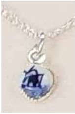
#160310 Necklace $14.95