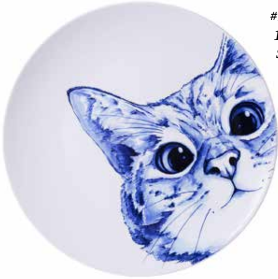
#297483 12" Cat $87.95