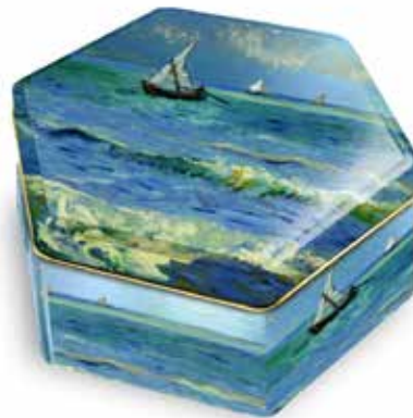
#105340 Storage Tin $11.95