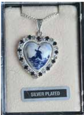
162380 - $20.95