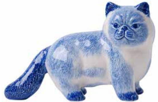
#297808 Cat 3.5"H x 5.75"L $29.95