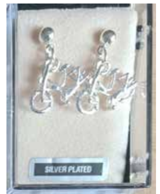
162394 - $16.95