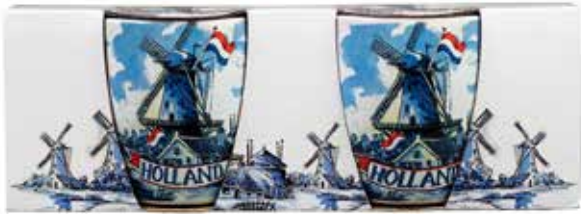
#039714 Set of 2 Mugs $16.95