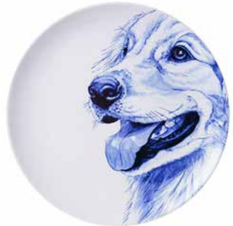
#297486 10.5" Dog $67.95