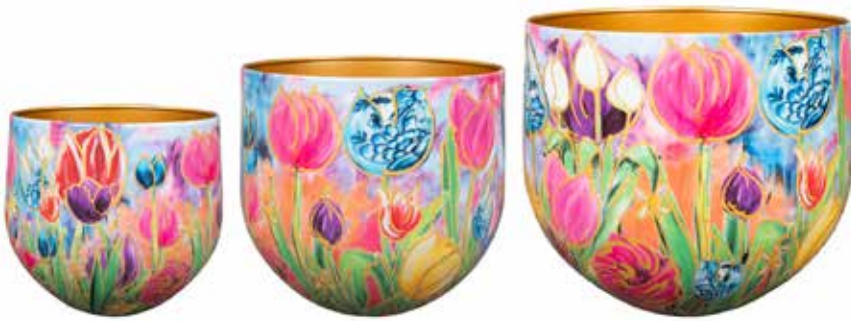
#039744 Set of 3 Pots $339.99