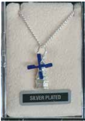
162362 - $17.95