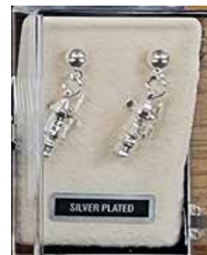
#160374 Earrings $17.95