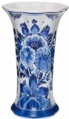
093022 8" Flared Vase $336.95