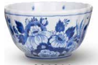
091011 5.5" dia. $285.95