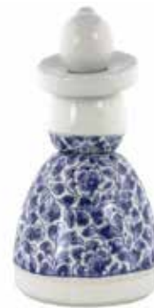
094664 6.5" Proud Mary Flower Pattern $109.95