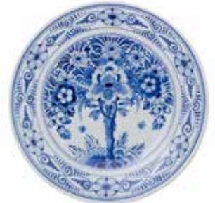
092071 Tree/Floral Plate - 7" $223.95