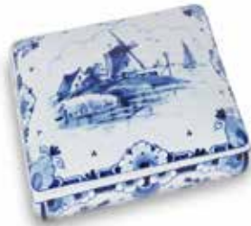
091069 Covered Table Box Windmill - 5"x5"x2" $500.95