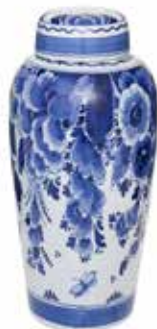
094001 8" $485.95