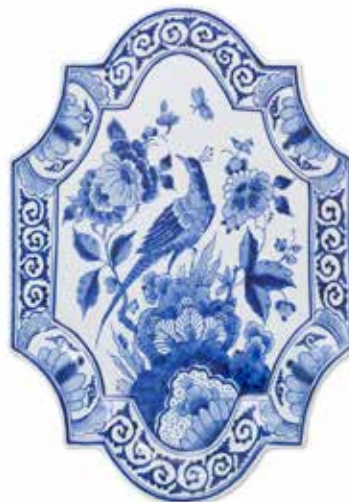
092119 12" x 9" Vertical Plaque $445.95