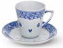
091140 3.5" Coffee Cup & Saucer $348.95