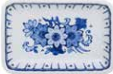
091150 4" x 2.5" Candy Dish $109.95