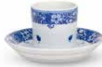
091186 2.5" Espresso Cup & Saucer $219.95