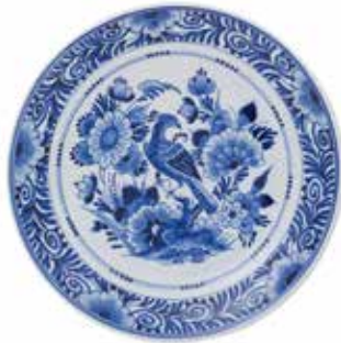
092007 7" $260.95