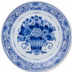
092204 7" $260.95