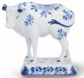
091068 4" $474.95