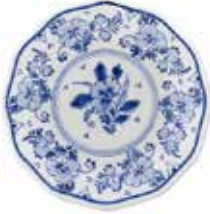
091120 4" Scalloped Dish $125.95