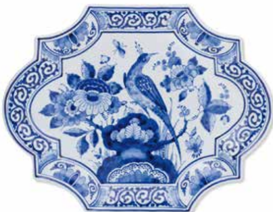
092016 9"x 12" Horizontal Plaque $445.95