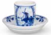
091185 2.25" Mokka Cup & Saucer $268.95