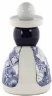
094666 6.5" Proud Mary Pattern Cobalt $109.95