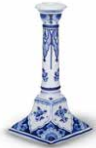
091085 7.25" Candleholder $298.95