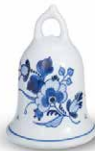
096412 3.25" Bell $114.95