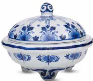
091010 5.5" Footed Covered Dish $384.95