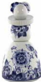
094662 6.5" Proud Mary Classic Flower $109.95