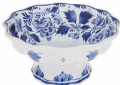
091032 9" dia. Fluted Foot $629.95