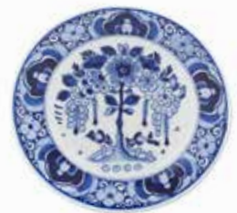
092068 5.5" $199.95 Tree of Life