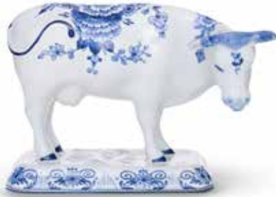
091071 6" $718.95