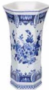
093040 7" $423.95