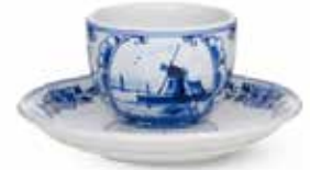
091128 3" Cup & Saucer $279.95