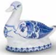
096450 3" $241.95