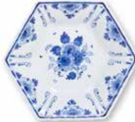
091019 6.5" Hexagon Plate $268.95