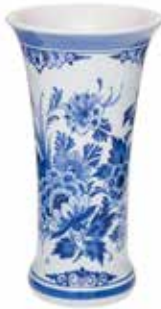
093045 7" $336.95