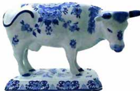
091071 6" $598.97