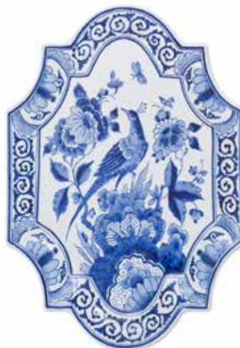
092119 12" x 9" Vertical Plaque $359.95