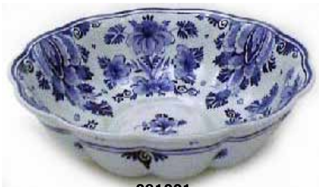
091001 10.75" dia. $595.00