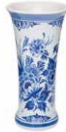
093045 7" $279.95