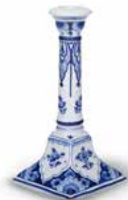
091085 7.25" Candleholder $249.95