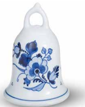
096412 3.25" Bell $89.95