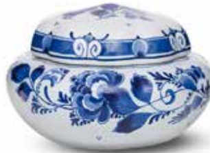
091017 6.25" Covered Dish $319.00