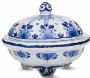
091010 5.5" Footed Covered Dish $350.00