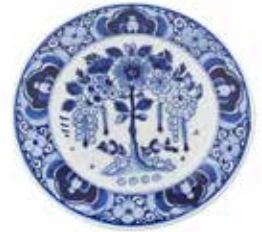
092068 5.5" $159.95 Tree of Life