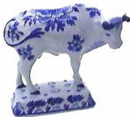
091068 4" $350.00