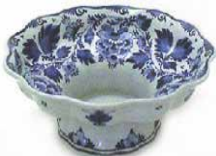
091032 9" dia. Fluted Foot $539.95