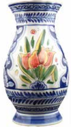
011841.23 7.5" H - Ribbed Vase $164.95