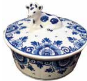
010515.12 Butter Dish - 4" D $89.95