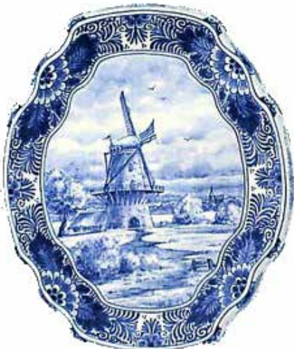
012046.41 Unica Applique 10.5" H x 8.75" W $382.95