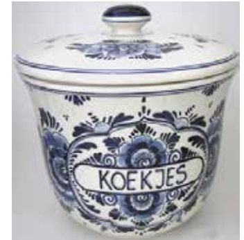
010902.1K 8" H $174.95