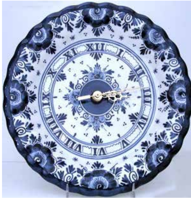
010775.12 10" Plate Clock $134.95