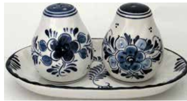
010562.12 Salt & Pepper - 3.25" H $66.95