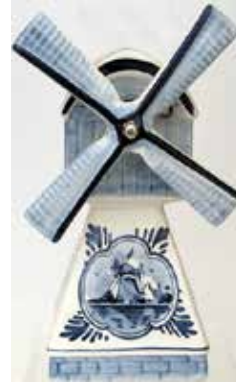
019856.11 8.5" H - Musical $79.95