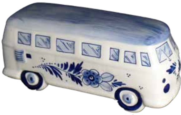
011481.12 VW Van $149.95