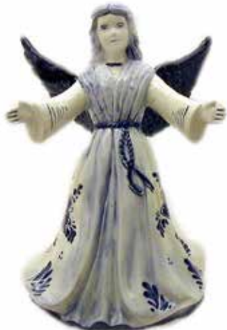
011489.12 Tree Topper 9.5" H $124.95