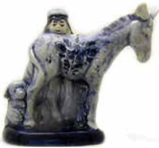
011470.12 Donkey 4" H $62.95