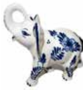
010583.12 Elephant 3" H $66.95