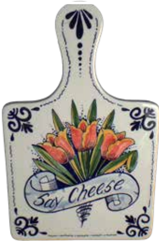
010900.13 Cheese Board $67.95