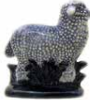
011467.12 Sheep 3" H $44.95