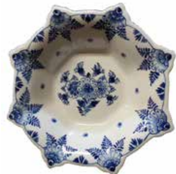
012909.42 7" Octagonal Dish $149.95