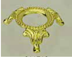
011710 5/8" H $7.95