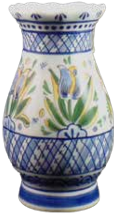
011839.13 5.75" H - Ribbed Vase $109.95