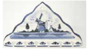
010568.11 Spoon Rack 7.75" L x 3.75" H $47.95