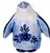
010714.12 Penguins, asst'd- 2.5" $28.95