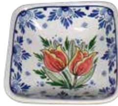
010930.23 Square Tapas Dish $89.95