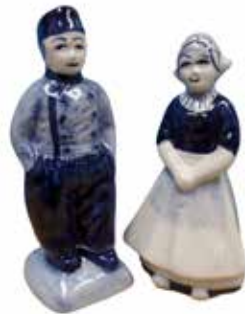
010558.12 Dutch Couple - 4" H $54.95