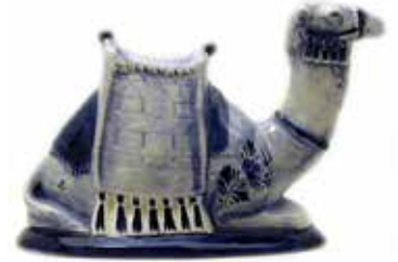
011469.12 Sitting Camel 4.25" H $77.95