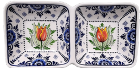
010931.23 Double Tapas Tray $149.95