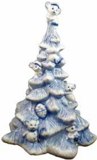
011450.12 Christmas Tree w/mice 15" H $209.95