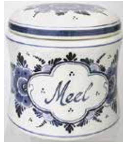
010511.1M 5" x 5" $87.95