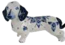
010792.12 Dachshund Dog $134.95