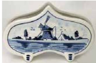
010549.11 Napkin Holder - 4.25" H $62.95