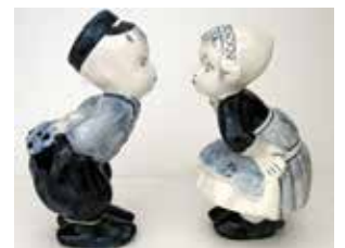
010566.12 Kissing Kids - 4.25" H $72.95