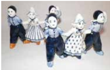
010563.12 Dancing Trio - 3" H $79.95