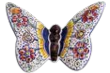
010740.22 Butterfly $99.95