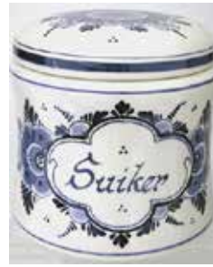
010511.1S 5" x 5" $87.95