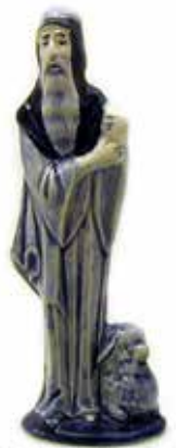
011474.12 Shepherd 6.25" H $59.95