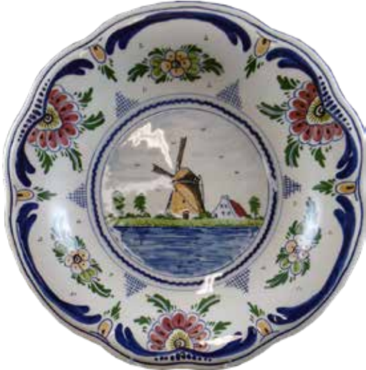
010404.21 12" Diameter - 2" Deep Plate $215.95