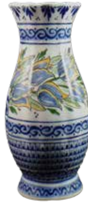
011841.13 7.5" H - Ribbed Vase $164.95