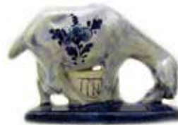
011468.12 Goat 2.5" H $46.95