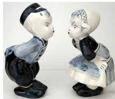
010565.12 Kissing Kids - 6.75" H $79.95