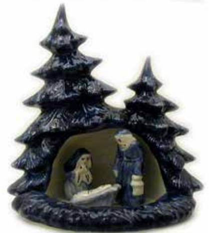
011605.12 Nativity in Tree 9" H $139.95