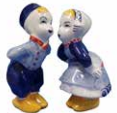
010566.13 Kissing Kids - 4.25" H $87.95