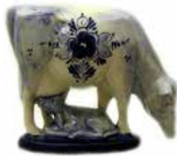
011466.12 Cow 3.5" H $54.95