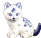
010690.12 Kitten - Asst'd $59.95