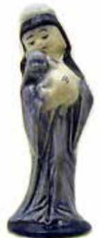
011480.12 Child Shepherd 4.25" H $49.95