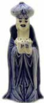
011476.12 Wiseman #3 4.75" H $56.95