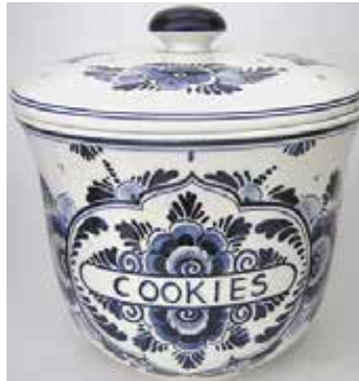
010902.1C 8" H $174.95