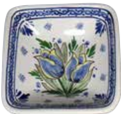
010930.13 Square Tapas Dish $89.95