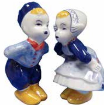
010565.13 Kissing Kids - 6.75" H $99.95