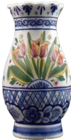
011839.23 5.75" H - Ribbed Vase $109.95