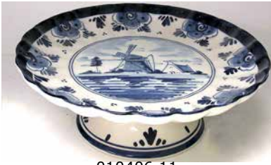
010406.11 6.25" W $79.95