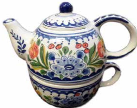
011420.23 Tea for One $209.95