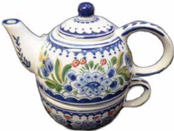
011420.13 Tea For One $209.95