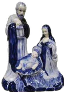
011443.12 Joseph & Mary $249.95