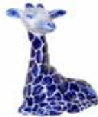
010732.12 Giraffe 3.75" H $69.95