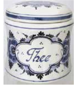
010511.1T 5" x 5" $87.95