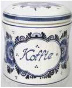
010511.1K 5" x 5" $87.95