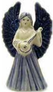
011544.12 4" H (asst) $54.95