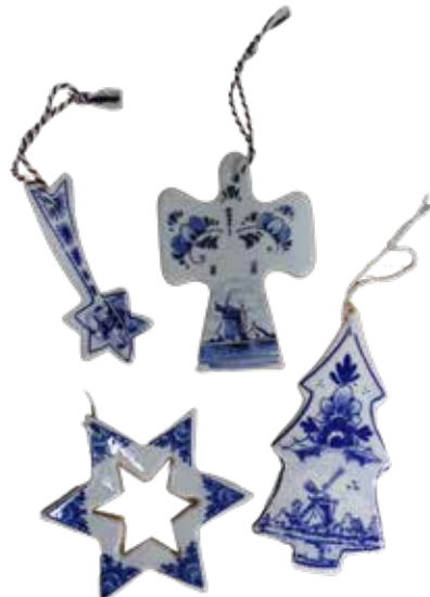
011530.12 Asst'd Flat Ornaments $12.95