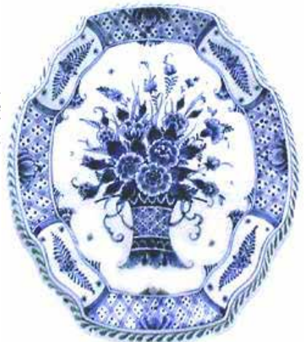
012046.42 Unica Applique 10.5" H x 8.75" W $382.95

Designs are handpainted and may vary from those pictured.