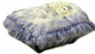
011472.12 Baby Jesus 3.25" W $49.95