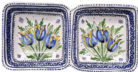
010931.13 Double Tapas Tray $149.95