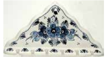
010568.12 Spoon Rack 7.75" L x 3.75" H $47.95