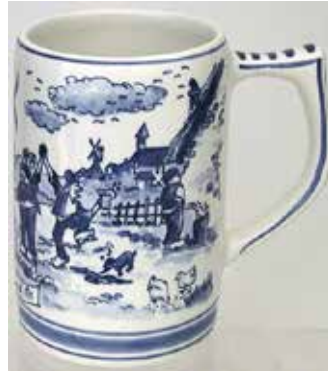
015246 5" H Dutch Way of Life Stein $39.95