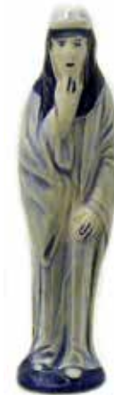
011479.12 Shepherd 6" H $49.95