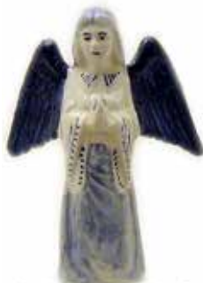
011471.12 Kneeling Angel 4" H $39.95