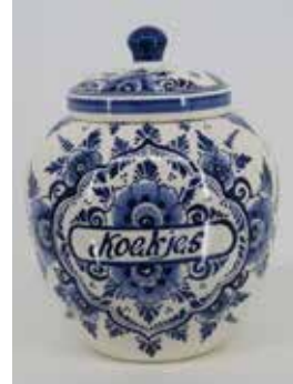
010503.1K 8.25" H $189.95