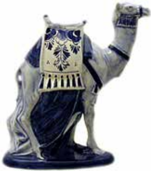
011465.12 Standing Camel 7" H $94.95