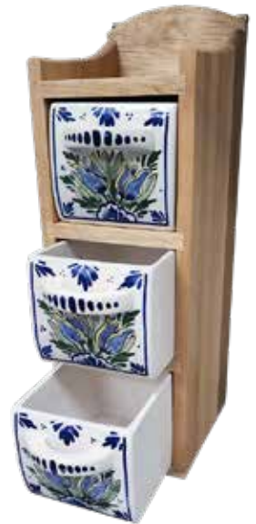
011490.13 Wood Rack w/3 Drawers $191.95