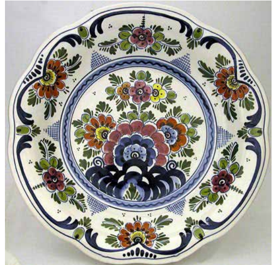
010404.22 12" Diameter - 2" Deep Plate $215.95