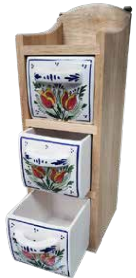
011490.23 Wood Rack w/3 Drawers $191.95