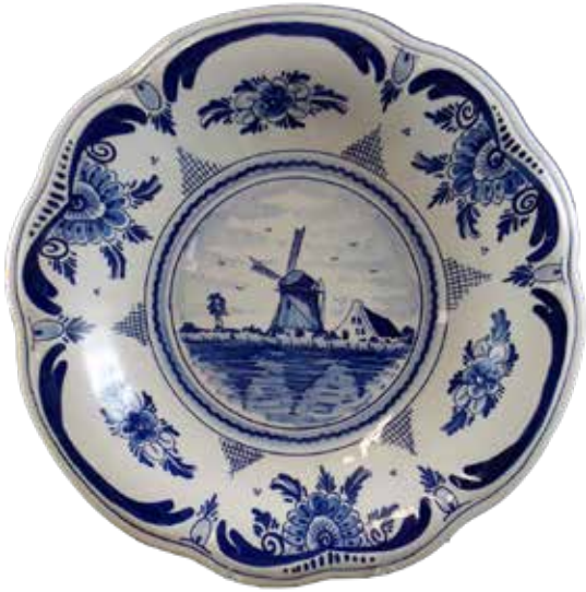
010404.11 12" Diameter - 2" Deep Plate $186.95