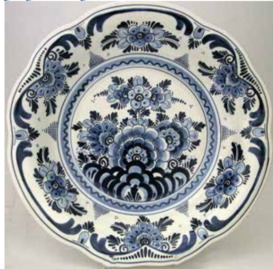
010404.12 12" Diameter - 2" Deep Plate $186.95