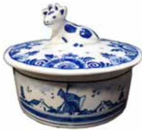
010515.11 Butter Dish - 4" D $89.95