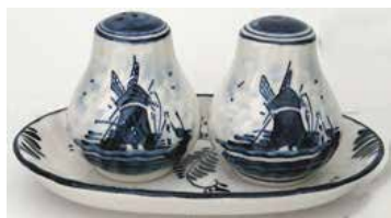
010562.11 Salt & Pepper - 3.25" H $66.95