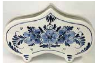
010549.12 Napkin Holder - 4.25" H $62.95