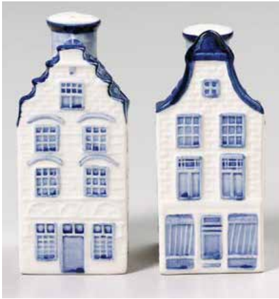
6530557 4" tall $9.95