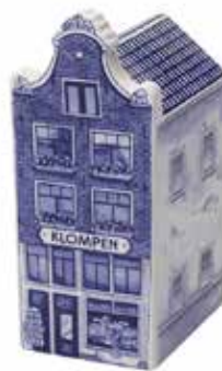
290706 (#6) Klompen Shop