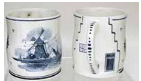
010779.11 Canalhouse Mug 3.5" Tall $27.95