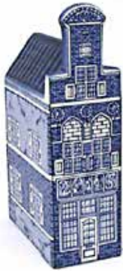
290126 (#6) Halsgevel (Neck Gable)