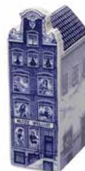
290707 (#7) Bordello