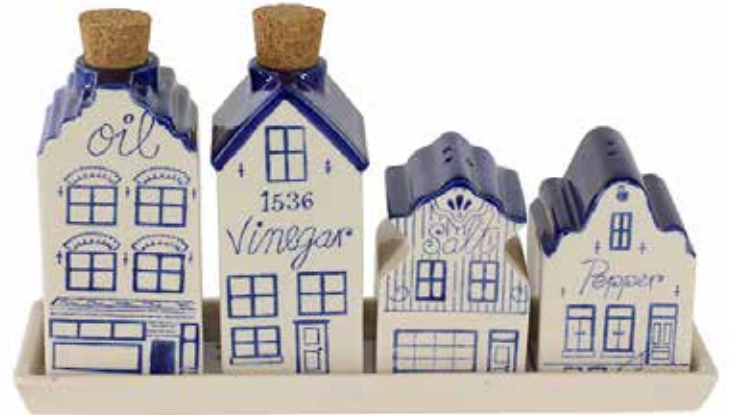
039856 9" long x 4.5" tall $25.95