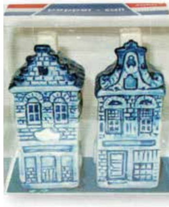
271167 3.5" tall $11.95