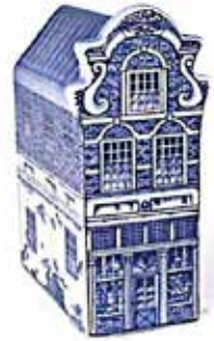
290137 (#17) Fantasie (Fantasy Gable)