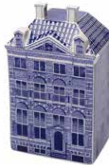
290701 (#1) Rembrandt House

The Bordello and Coffee Shop Canalhouses are part of the new series. Buyers should be aware that they are "authentic" to today's Amsterdam and their "R-rated" decoration may not be acceptable to all customers.