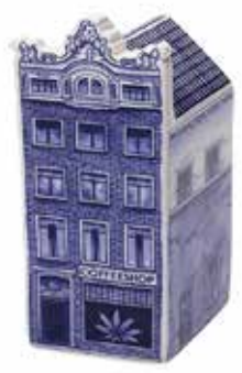
290708 (#8) Coffee Shop