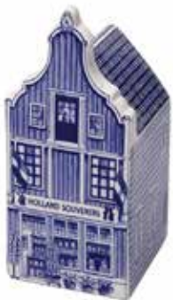
290703 (#3) Souvenir Shop