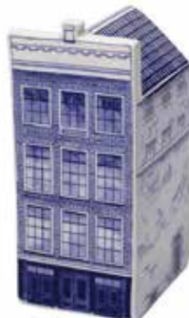
290705 (#5) Anne Frank House