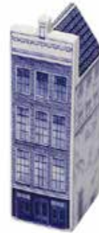
290805 (#5) Anne Frank House