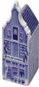
290803 (#3) Souvenir Shop