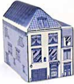
290131 (#11) Skinniest House in Amsterdam