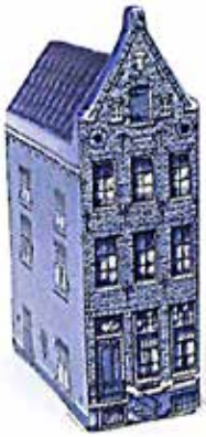
290121 (#1) Puntgevel (Point Gable)

Large Canalhouses are approximately 7" tall - each house is $19.95