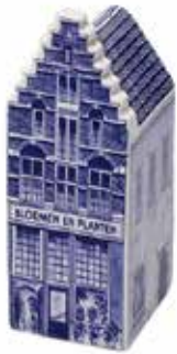
290802 (#2) Flower & Plant Shop