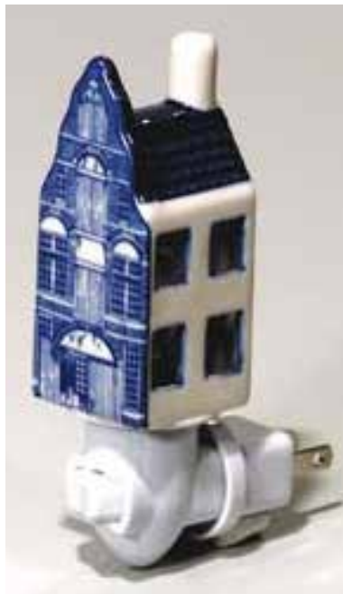
Includes Light and Bulb 6431587 5.25" tall $14.95