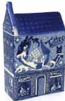
290130 (#10) Tattoo Parlor