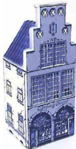
290333 (#13) Clothier