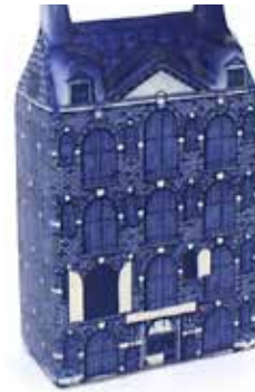
290134 (#14) Warehouse