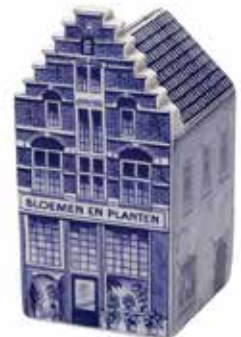
290702 (#2) Flower & Plant Shop