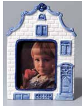
4630111 Canalhouse Frame (3x5) $5.00