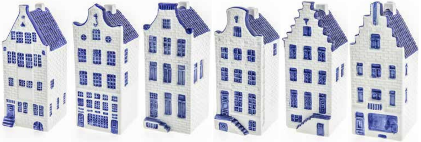
290100 #1 Point Gable