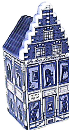
290335 (#15) Bordello