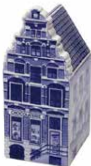
290704 (#4) Chocolatier