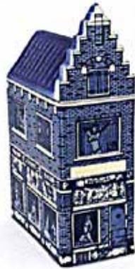
290129 (#9) Bordello