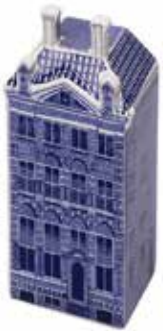
290801 (#1) Rembrandt House

Small Canalhouses are approximately 3" tall - each house is $10.95 Large Canalhouses are approximately 5 1/2" tall - each house is $16.95