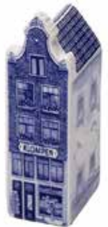
290806 (#6) Klompen Shop