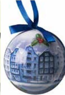
297971 2.5" $7.95 (plastic)